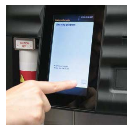
11. Refill beans if necessary. Press "Finish" to return to normal operating mode.