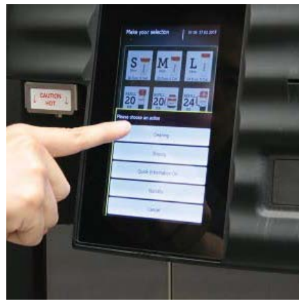
3. Select "Cleaning"