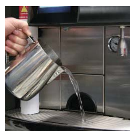
12. Flush drip tray with a pitcher of water. Wipe the machine exterior thoroughly with a clean, damp cloth to remove residue.