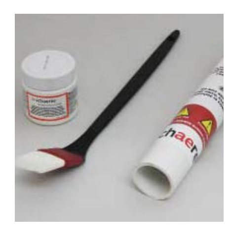
1. Use only Schaerer cleaning supplies for this procedure.