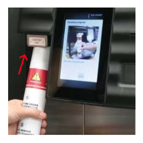
4. Insert cleaning tube. Press "Continue".