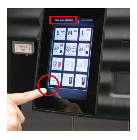
2. When the "Start cleaning" message appears on the upper left corner. Press and hold (3-5 seconds) the lower left corner of the touch screen to bring up service menu.