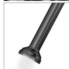
PEEK Material Steam Wand